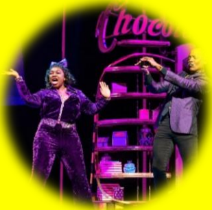
MR OR MRS BEAUREGARDE